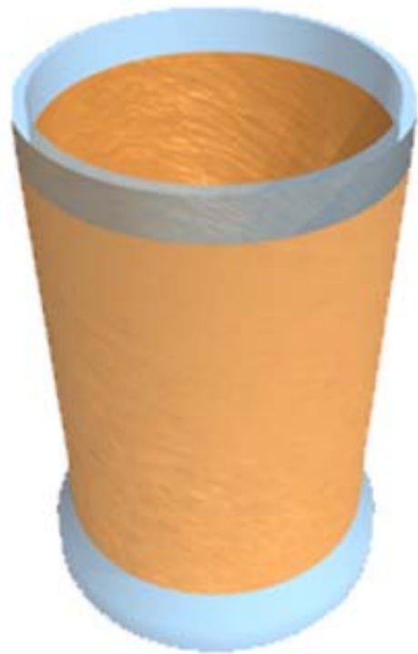
A Modern looking metallic and glass pencil/pen holder.

Every model was done in Modeller and rendered in Lightwave. They all have been accurately modelled to real life sizes.